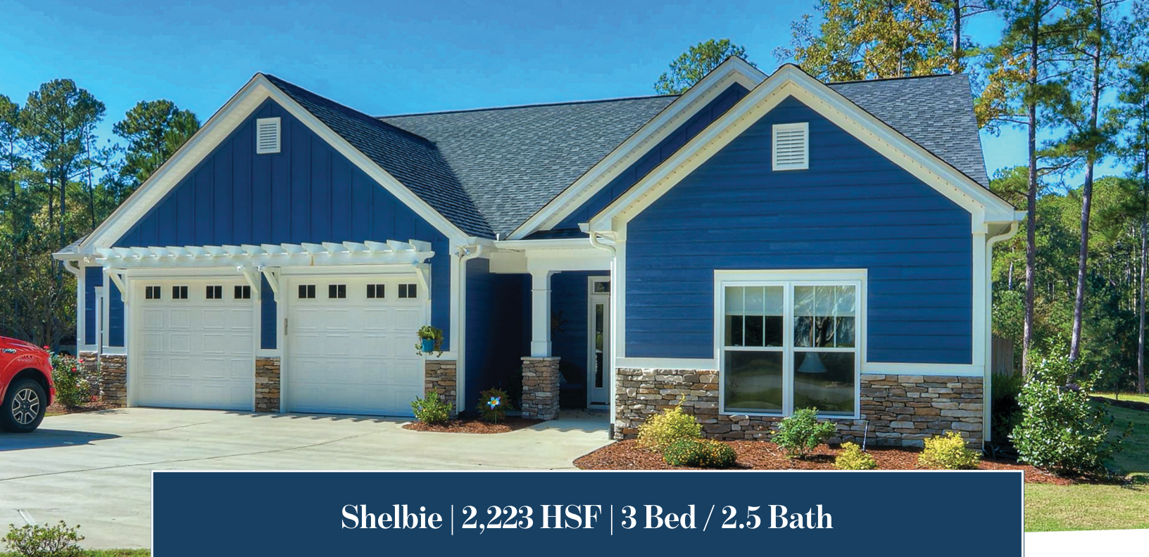
Shelbie | 2,223 HSF | 3 Bed / 2.5 Bath Offered by Lee Builders