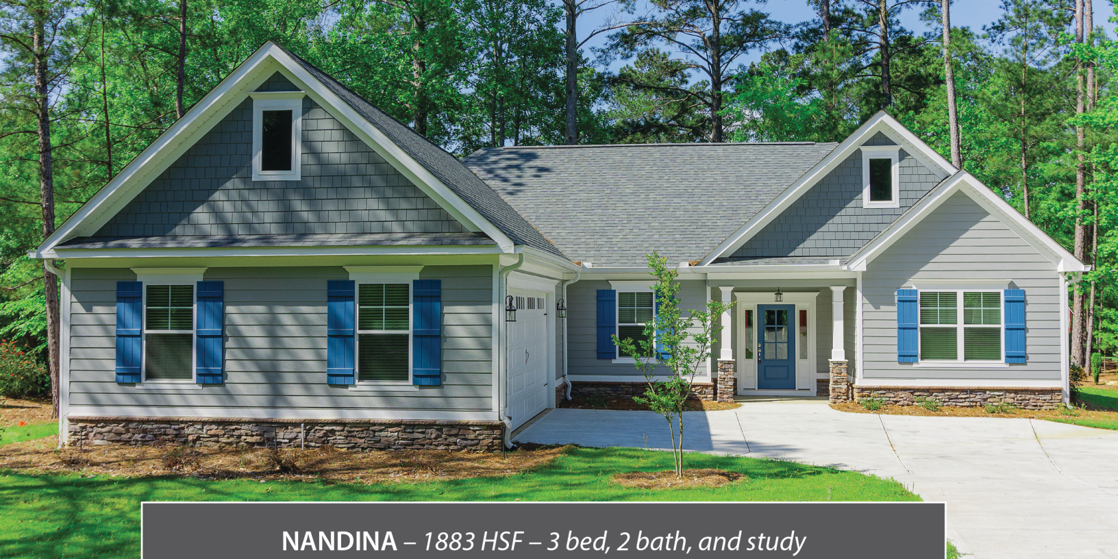
NANDINA – 1883 HSF – 3 bed, 2 bath, and study Offered by Capital Home Builders