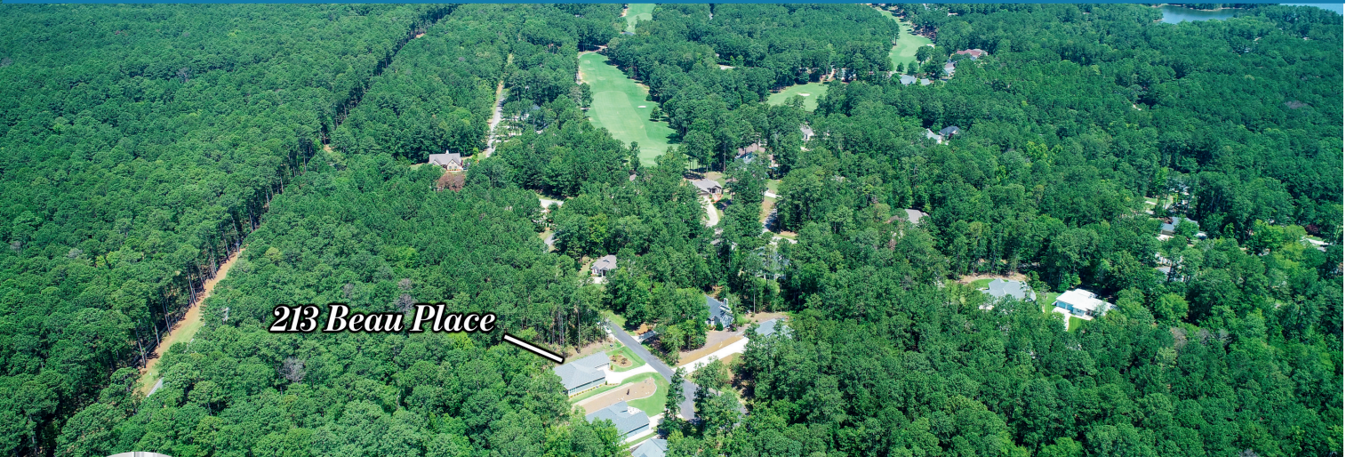
213 Beau Place