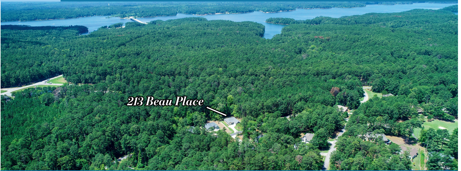
213 Beau Place